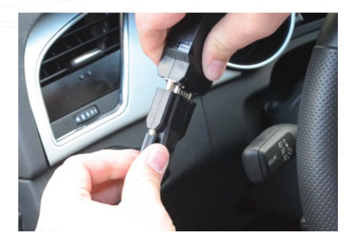
Connect the harness to the control box and tighten connectors.

Please download the latest copy of this document from www.p3cars.com/install