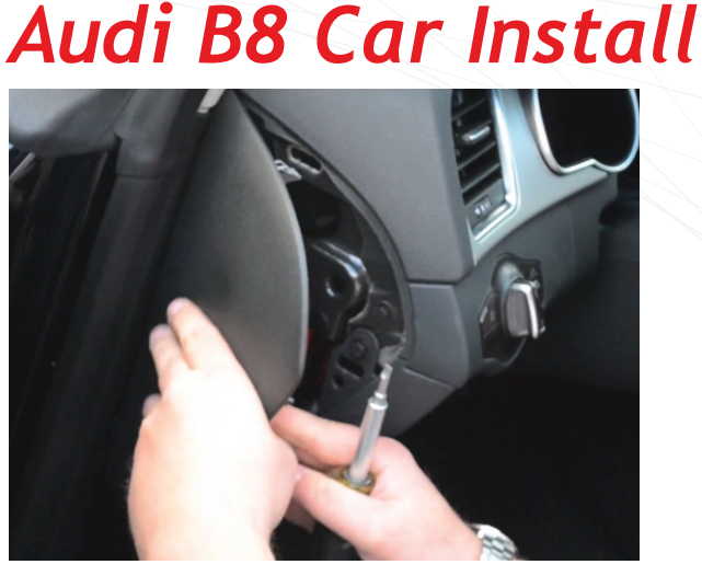
Remove side dash cover. Pry from the bottom and it just pops off.

Please download the latest copy of this document from www.p3cars.com/install