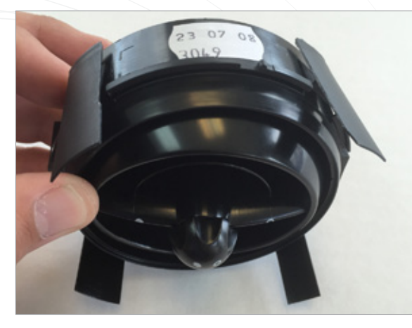
Once you have inserted all 4 of your shims pull the vent housing straight out toward you.

Please download the latest copy of this document from www.p3cars.com/install