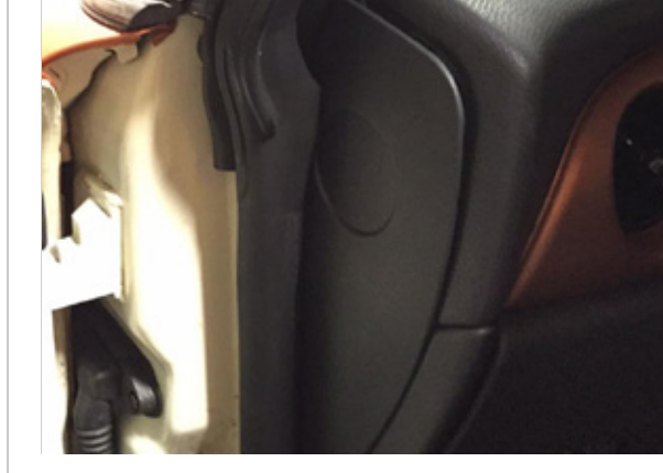
Using your finger or a soft trim pry tool open the side dash cover panel.