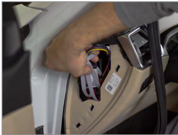
10 Tuck the cables and the control box into the side of the dash

WARRANTY & LIABILITY: Neither P3 Cars, nor its dealers or agents shall be liable in any way, for any damage, loss, injury or other claims, resulting from the installation or use of this product. By purchasing or installing this product, you assume all liability of any kind connected with the use and/or application of this product. If you are unsure that you can safely install and use this product, consult a qualified installer or mechanic. The warranty on this product covers only the product itself for a period of 6 months from the date of purchase, and it will be at our discretion to repair or replace the affected parts. No user serviceable parts inside. Warranty will be voided if product shows physical damage.