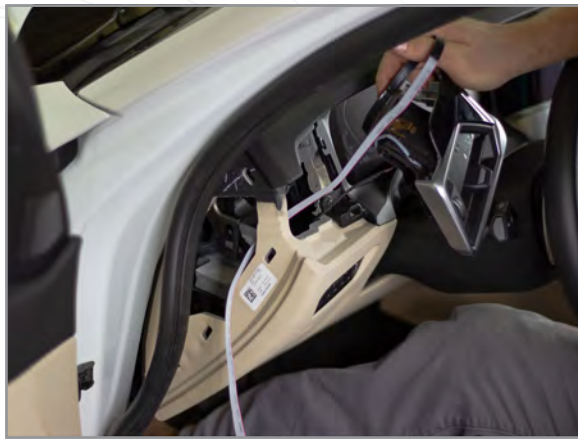
6 Feed the display cable through the vent hole and out the side of the dash

For additional install information please visit www.p3gauges.com/install