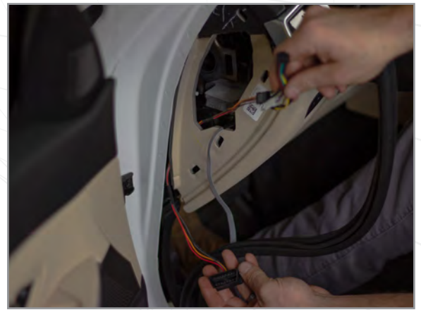
7 Feed the OBD2 cable from the bottom and out through the side of the dash