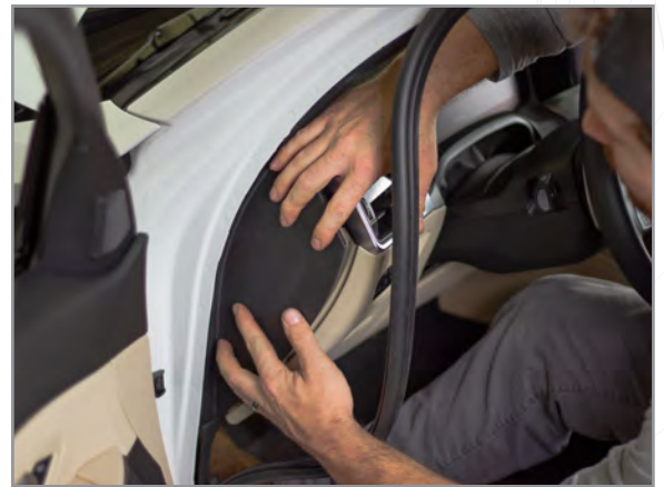
11 Replace the side dash panel