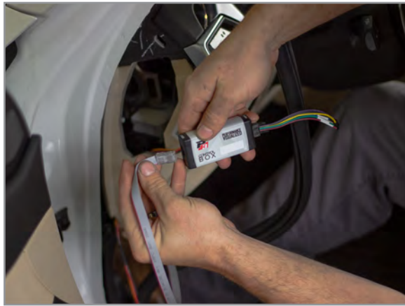
8 Connect the display and the main harness to the control box