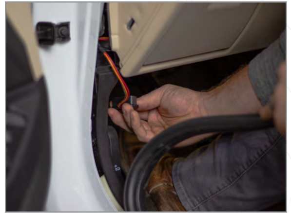
9 Connect the OBD2 connector to the vehicle's OBD2 port

WARRANTY & LIABILITY: Neither P3 Cars, nor its dealers or agents shall be liable in any way, for any damage, loss, injury or other claims, resulting from the installation or use of this product. By purchasing or installing this product, you assume all liability of any kind connected with the use and/or application of this product. If you are unsure that you can safely install and use this product, consult a qualified installer or mechanic. The warranty on this product covers only the product itself for a period of 6 months from the date of purchase, and it will be at our discretion to repair or replace the affected parts. No user serviceable parts inside. Warranty will be voided if product shows physical damage.