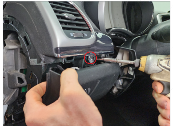
5b Remove hex bolt below vent trim