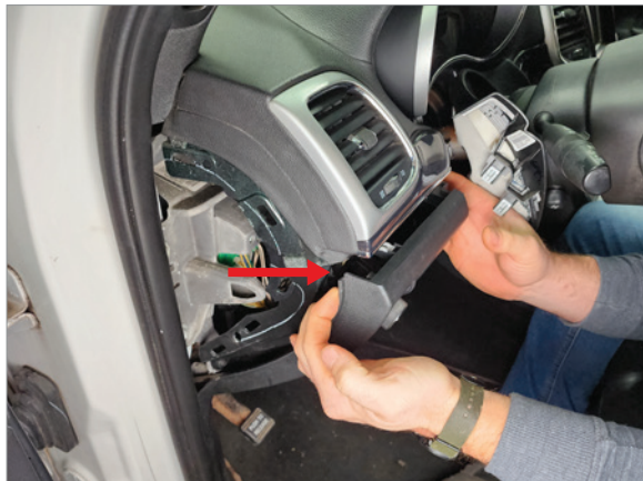
5a Pull lower dash trim toward driver to release clips

WARRANTY & LIABILITY: Neither P3 Cars, nor its dealers or agents shall be liable in any way, for any damage, loss, injury or other claims, resulting from the installation or use of this product. By purchasing or installing this product, you assume all liability of any kind connected with the use and/or application of this product. If you are unsure that you can safely install and use this product, consult a qualified installer or mechanic. The warranty on this product covers only the product itself for a period of 6 months from the date of purchase, and it will be at our discretion to repair or replace the affected parts. No user serviceable parts inside. Warranty will be voided if product shows physical damage.