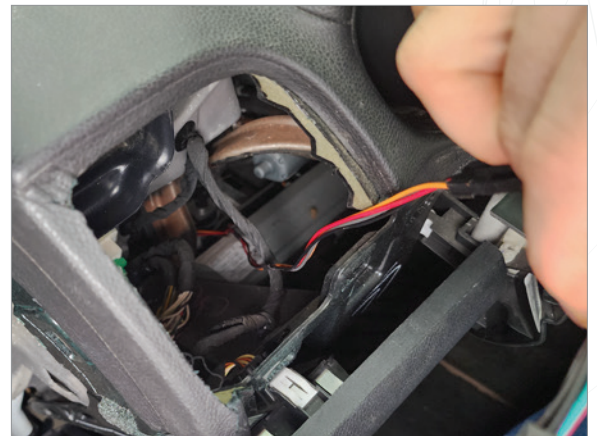
8b Top view of OBD2 cable routing