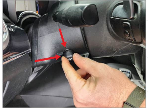
2 Move steering wheel down and toward driver