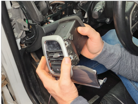
11 After installing display into vent replace vent trim