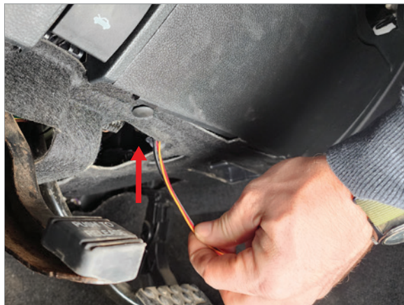
8a Feed OBD2 cable up through dash as shown and plug OBD2 connector into OBD2 port

WARRANTY & LIABILITY: Neither P3 Cars, nor its dealers or agents shall be liable in any way, for any damage, loss, injury or other claims, resulting from the installation or use of this product. By purchasing or installing this product, you assume all liability of any kind connected with the use and/or application of this product. If you are unsure that you can safely install and use this product, consult a qualified installer or mechanic. The warranty on this product covers only the product itself for a period of 6 months from the date of purchase, and it will be at our discretion to repair or replace the affected parts. No user serviceable parts inside. Warranty will be voided if product shows physical damage.