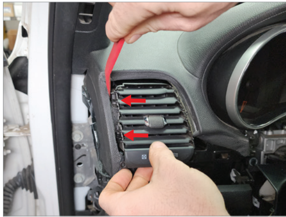
7a Use a trim pry tool to release clips on vent housing