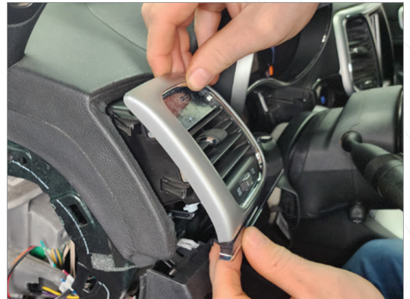
12 Reinsert Vent into dash, replace bolts and trim

WARRANTY & LIABILITY: Neither P3 Cars, nor its dealers or agents shall be liable in any way, for any damage, loss, injury or other claims, resulting from the installation or use of this product. By purchasing or installing this product, you assume all liability of any kind connected with the use and/or application of this product. If you are unsure that you can safely install and use this product, consult a qualified installer or mechanic. The warranty on this product covers only the product itself for a period of 6 months from the date of purchase, and it will be at our discretion to repair or replace the affected parts. No user serviceable parts inside. Warranty will be voided if product shows physical damage.