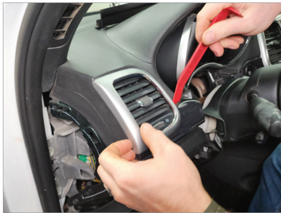
6a Use a trim pry tool to remove vent trim as shown

For additional install information please visit www.p3gauges.com/install