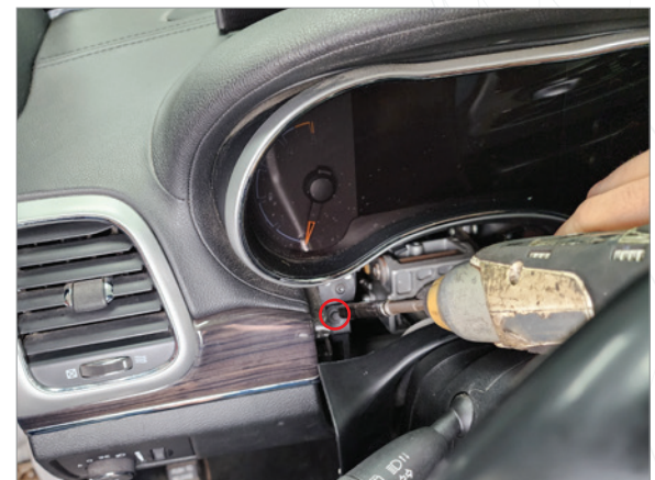
4 Remove hex bolt above steering column

WARRANTY & LIABILITY: Neither P3 Cars, nor its dealers or agents shall be liable in any way, for any damage, loss, injury or other claims, resulting from the installation or use of this product. By purchasing or installing this product, you assume all liability of any kind connected with the use and/or application of this product. If you are unsure that you can safely install and use this product, consult a qualified installer or mechanic. The warranty on this product covers only the product itself for a period of 6 months from the date of purchase, and it will be at our discretion to repair or replace the affected parts. No user serviceable parts inside. Warranty will be voided if product shows physical damage.