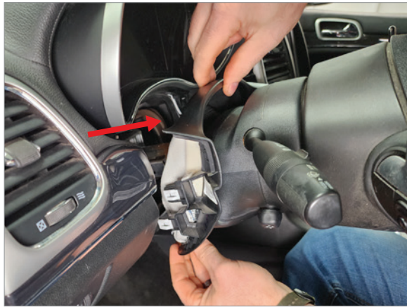
3 Remove steering column trim panel by pulling toward driver