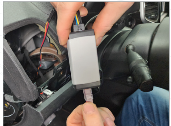
10 Plug Display Cable into Control Box