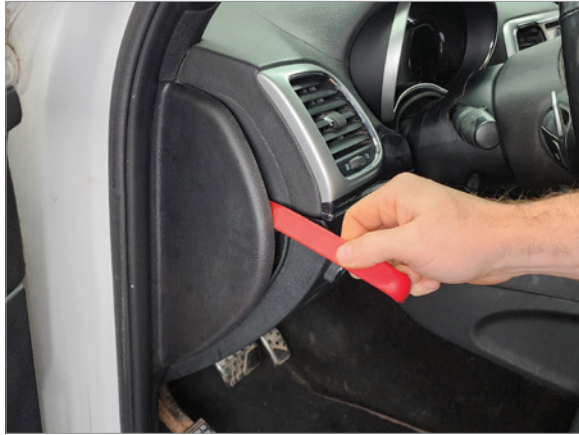
1 Remove dash side panel