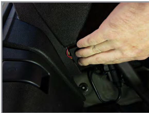
8b Plug the OBD2 cable into the OBD2 port

WARRANTY & LIABILITY: Neither P3 Cars, nor its dealers or agents shall be liable in any way, for any damage, loss, injury or other claims, resulting from the installation or use of this product. By purchasing or installing this product, you assume all liability of any kind connected with the use and/or application of this product. If you are unsure that you can safely install and use this product, consult a qualified installer or mechanic. The warranty on this product covers only the product itself for a period of 6 months from the date of purchase, and it will be at our discretion to repair or replace the affected parts. No user serviceable parts inside. Warranty will be voided if product shows physical damage.