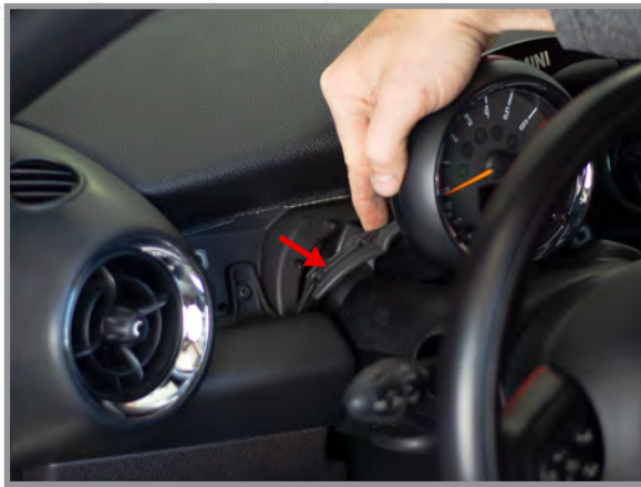
6a Pull back the rubber liner from the dash as shown

For additional install information please visit www.p3gauges.com/install