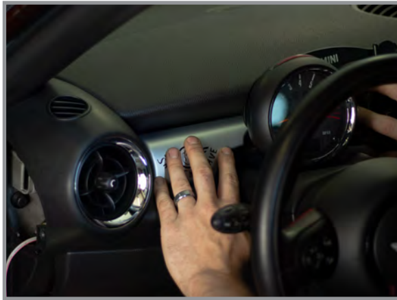
7 Replace the dash trim with the display enclosure installed