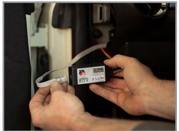
9 Connect the cables to the control box. Stow the box and replace the side dash panel