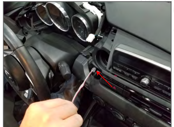
10a Feed display ribbon cable through dash as shown (See 10b)