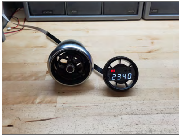
7 Follow our display install guide to install your display into your OEM vent