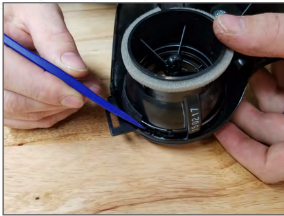
6a Release clips to remove vent from dash trim

For additional install information please visit www.p3gauges.com/install