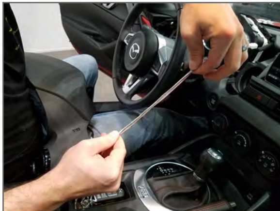
9 Fold display ribbon cable as shown to help feed it through dash

WARRANTY & LIABILITY: Neither P3 Cars, nor its dealers or agents shall be liable in any way, for any damage, loss, injury or other claims, resulting from the installation or use of this product. By purchasing or installing this product, you assume all liability of any kind connected with the use and/or application of this product. If you are unsure that you can safely install and use this product, consult a qualified installer or mechanic. The warranty on this product covers only the product itself for a period of 6 months from the date of purchase, and it will be at our discretion to repair or replace the affected parts. No user serviceable parts inside. Warranty will be voided if product shows physical damage.